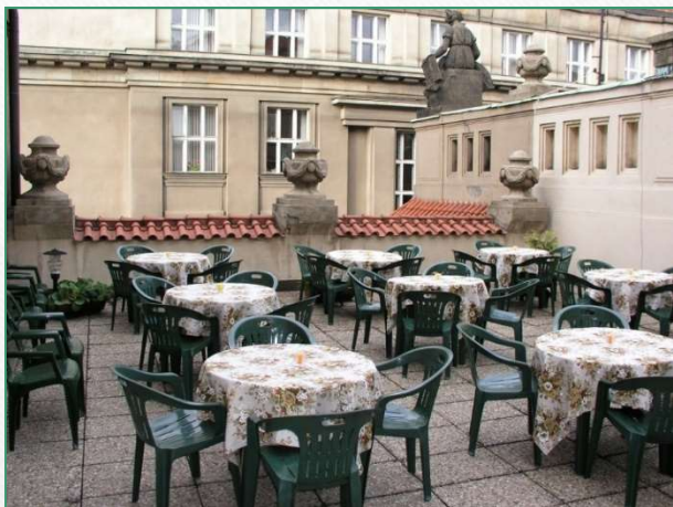
terrace 2 nd floor