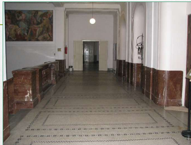
Poster session - the corridor in front of main lecture hall