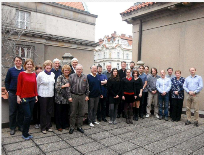
Staff of Dep. of Dosimetry and Application of Ionizing Radiation